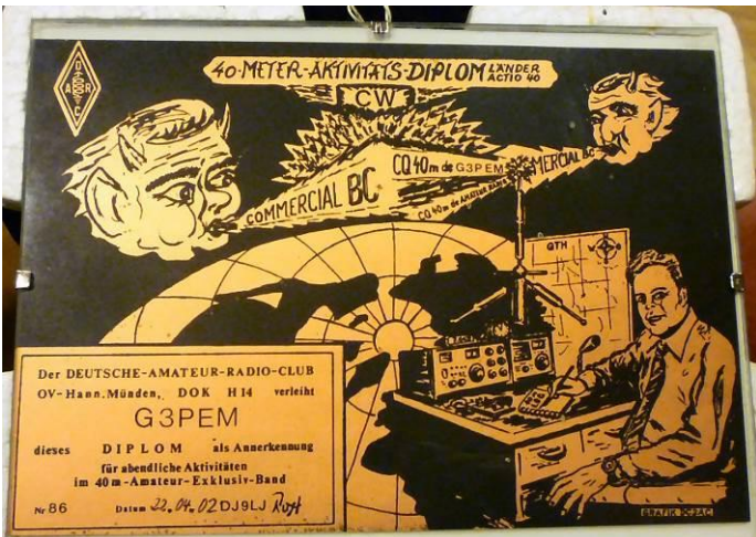
DARC 40m Award - unusually it is etched in copper!

Carl brought along slides and a wide variety of background material and awards to illustrate another branch of this fascinating hobby of ours.