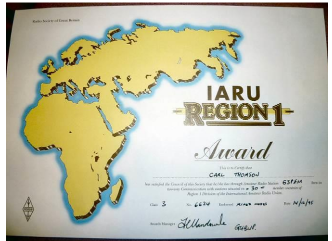
An example of one of the regional awards.

Topics included: How to start collecting awards and where to find details of the award programmes. Organising QSL cards and electronic logging can help matters! You can get awards based on Regions or other geographic features