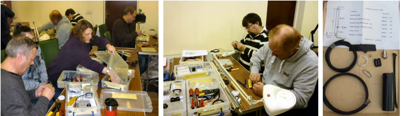
Practicals and 2m Slim Jims were popular in the rear Hawkins room

The third autumn Skills Night on November 20 th saw a host of hands-on activities. A popular feature was the 'Insight into Foundation and Intermediate Practicals', whilst other demos and regulars helped get the forty or so visitors entertained (as did another quiz session and some nice refreshments). Skills takes a Xmas break for December and will return in the New Year currently set for Monday January 15 th .