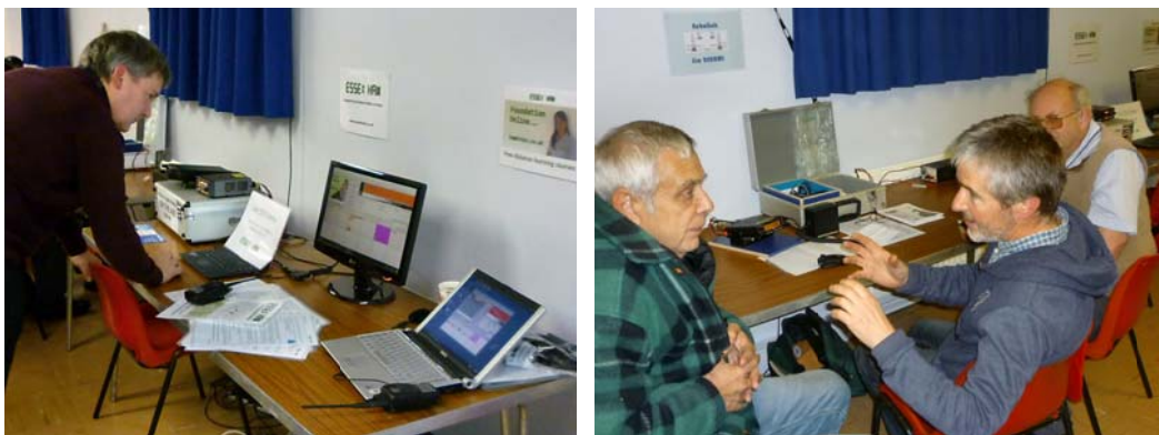
SSV and Echolink demos