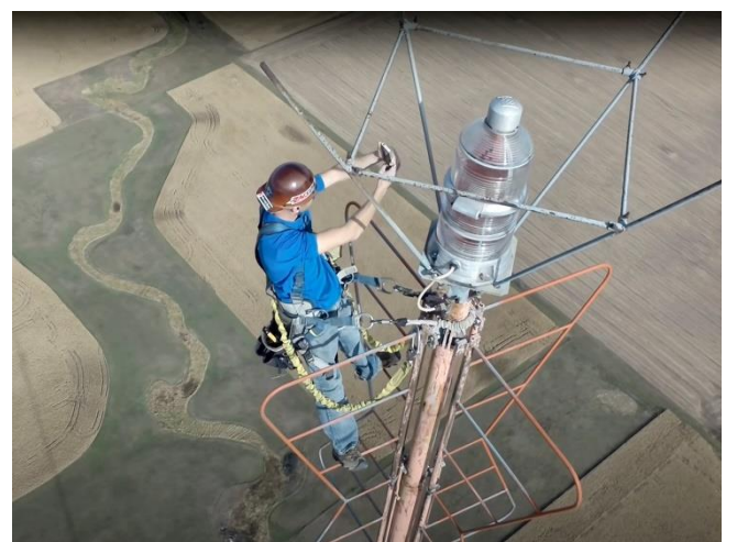
Changing a bulb on a 1500' TV Mast, South Dakota