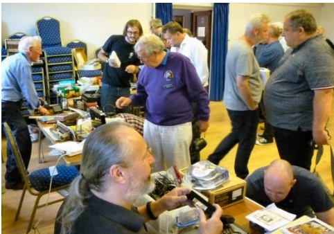
Table Top Sale Extra Info

On Tue 6 th September the great Table Top Sale returns to Danbury Village Hall.