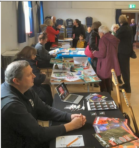
Plenty of local groups in the Main Hall