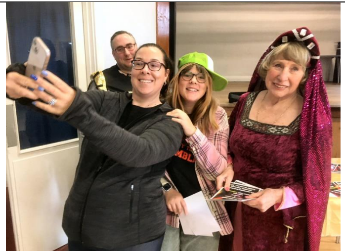
Danbury Players Selfie

Copyright – Chelmsford Amateur Radio Society - All contributors acknowledged