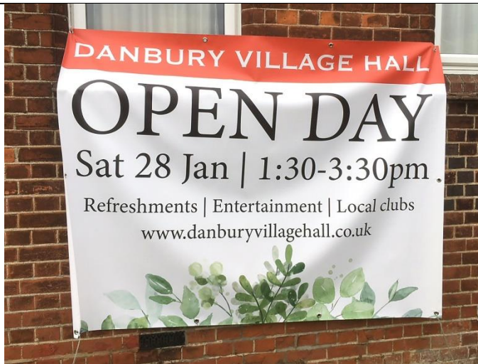
Flags were out and this Special Occasion Poster