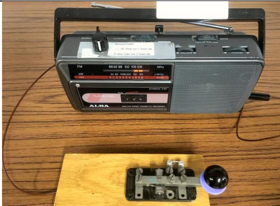
4 th = : Multipurpose radio and audio/speaker