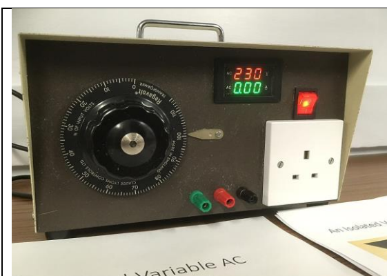
1 st : Main Isolating Variable AC PSU