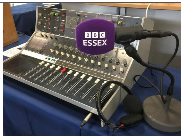
Exhibitors included BBC Essex with classic kit