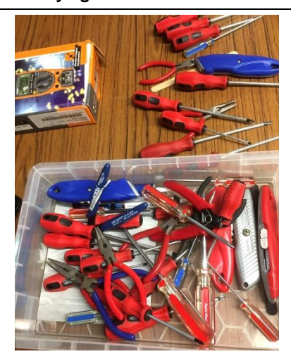
Surplus tools and meters