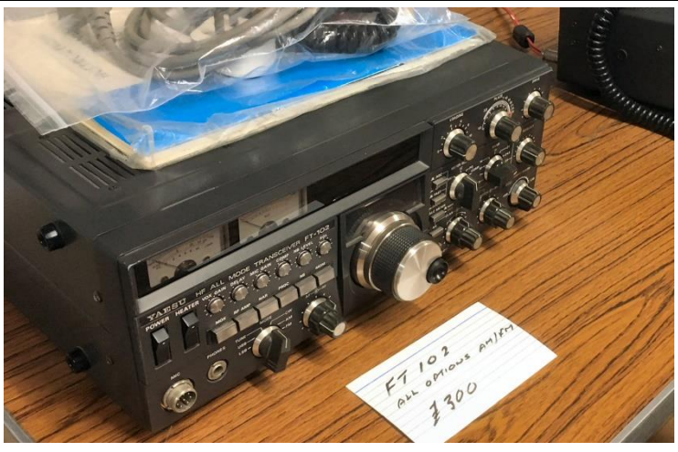
Yaesu FT102 for sale