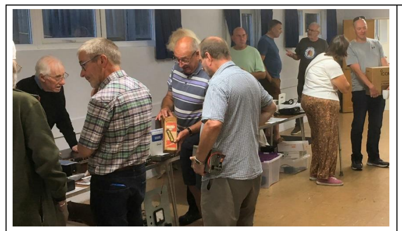
Attendees having a good browse

The evening had one of the highest turnouts of the year and proved to be a great 'recycling' and socialising opportunity with plenty of refreshments on hand to help things along.