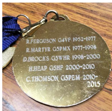
Past Presidents on the rear of the Badge – ready for its next entry