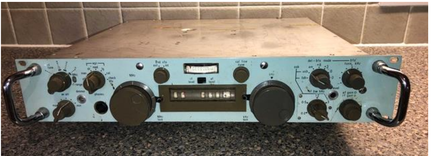
Racal 1217 receiver

As usual, we will have the famous raffle - with tea/coffee, biscuits and a warm welcome for the New Year !