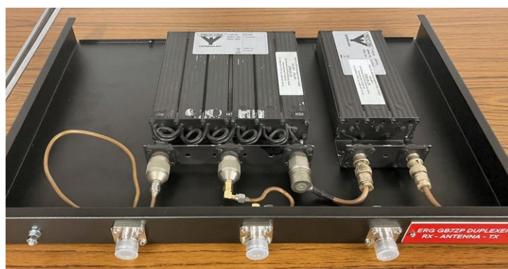
GB7ZP Duplexer/Filter re-build in a 1U screened 19" case - by Murray G6JYB