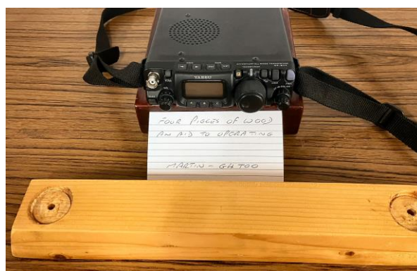
Four pieces of wood (two pairs laminated and varnished) for radio desk stands - by Martin Final G4TOO