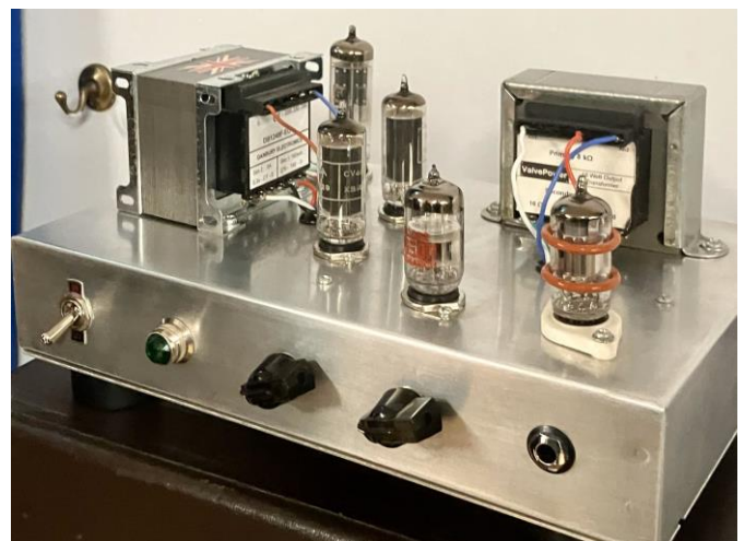
A modern Valve Amplifier