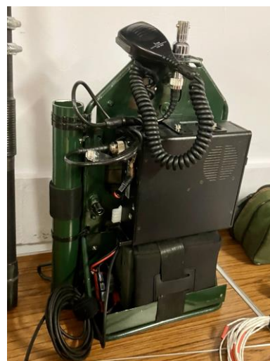
Backpack Portable Radio