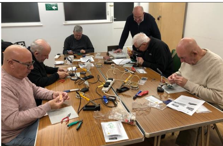
Kit Building in the Hawkins Room

Overall the good turnout led to a very enjoyable occasion, helped by the raffle, our usual supply of tea/coffee and biscuits. Our thanks to all! . The next similar session is expected to be our January meeting.