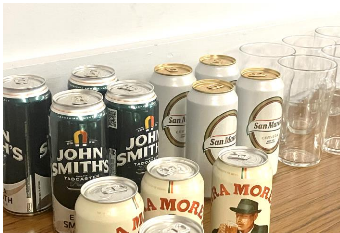
...and other refreshments !