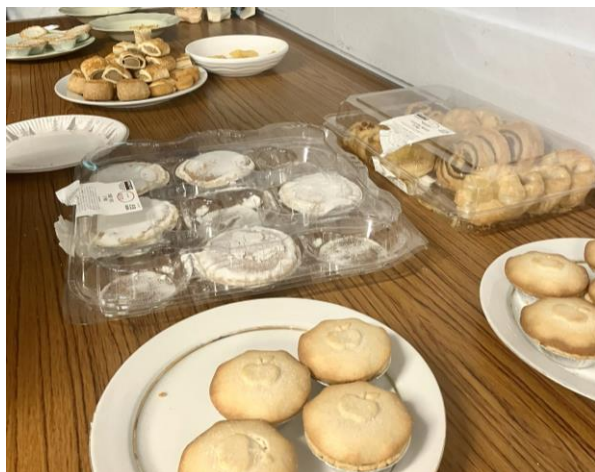
Some of the food...