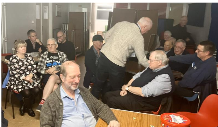
and drawing the raffle